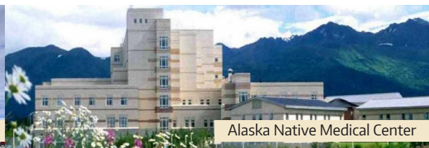
Alaska Native Medical Center